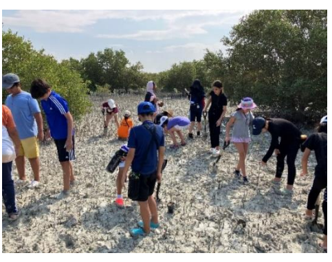
The students planted mangrove

The UAE aims to plant 100 million mangrove trees by 2030, and this Program aimed to contribute to that goal and raise awareness about the importance of mangroves among the students. The Foundation will continue to promote projects that contribute to environmental protection in the UAE and facilitate environmental exchange between the UAE and Japan.